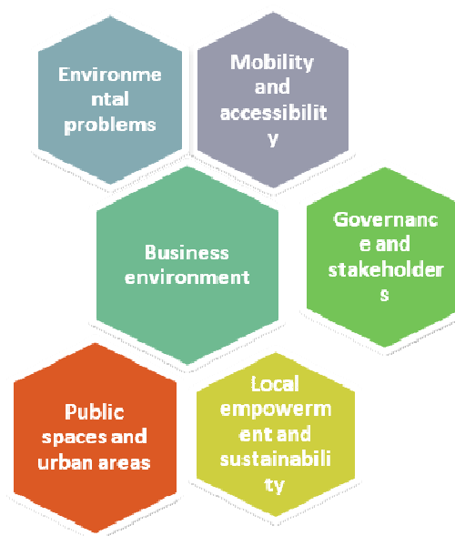
Figure 1 - The Working Groups of the workshop

WORKGROUP 6: Local empowerment and sustainability