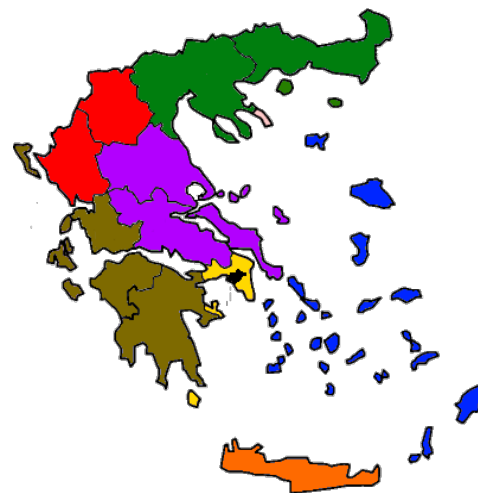
Figure 2: The Decentralized Administrations

1 Each color represents one of the 13 Regions, the black boundary represents the former prefectures and the white boundary represents the municipalities.