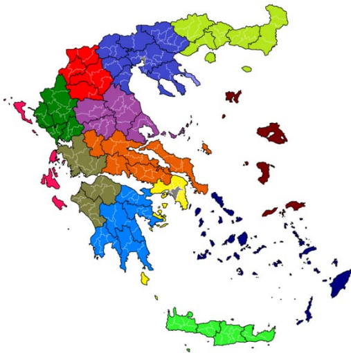
Figure 1: Municipalities and Regions